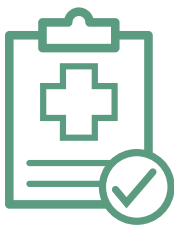
No Virus Detected