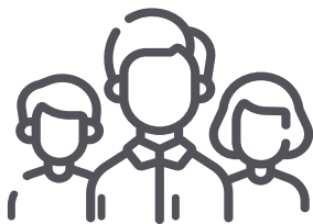
Multiple People (Pod) Sampled