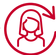
Individuals Get Retested