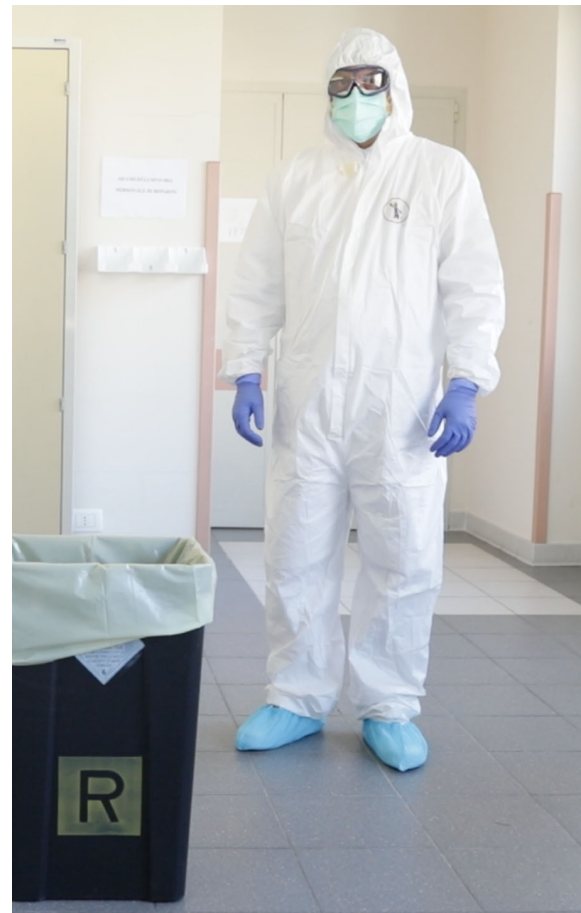
FIGURE 1 Health worker with a full body gown and all PPE for the safe execution of nasopharyngeal and/or oropharyngeal swabs [Color figure can be viewed at wileyonlinelibrary.com ]

The patient wears a surgical mask. She is informed about the procedure that is about to be performed. The patient must be seated in a comfortable position with his head resting on the back of the chair. The patient's head must be placed on a horizontal plane parallel to the floor. The patient is asked to lower the mask by uncovering only her nose and keeping the mouth closed. After opening the swab in a sterile manner, the operator positions the patient laterally in order to avoid direct droplets from sneezing or coughing. The swab is inserted gently into the nostril. The insertion must be parallel to the floor of the nasal fossa. The swab is kept medial and facing the nasal septum (do not insert the swab upward, as in this case the swab stops at the level of the nasal turbinates and the viral RNA sampling may not be significant). It is important to use the mark on the swab stick as a depth reference (Figure 2). However, when the operator feels an obstacle to further introduction, it means that the swab will have reached the posterior wall of the nasopharynx. With clockwise and counterclockwise movement, repeatedly rub the swab against the posterior wall of the nasopharynx (Figure 3), for about 10 to 15 seconds. Extract the swab from the nostril taking care not to contaminate it upon exit, introduce it into the test tube and break it at the mark on the stick. In case of difficulty in introducing the swab into a nasal fossa due to deviation