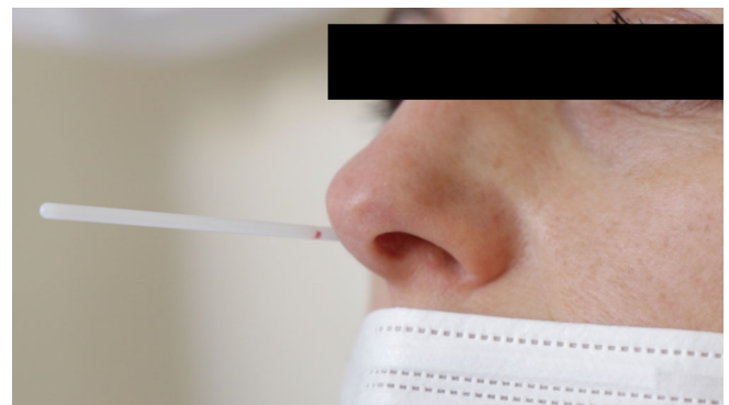
FIGURE 2 The mark on the swab stick indicates the correct insertion depth [Color figure can be viewed at wileyonlinelibrary.com ]

of the nasal septum or hypertrophy of the inferior turbinates, proceed with the same technique in the contralateral nasal fossa. The endoscopic vision shown in the video has a didactic purpose only; the nasopharyngeal swab should not be performed with the aid of the endoscope.