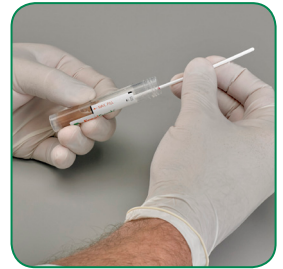
Holding the swab shaft between thumb and finger, mash and mix the stool specimen against the side of the tube to evenly disperse and suspend the specimen in the medium.