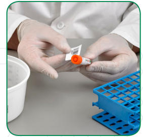
Write patient's name and demographics on the tube or apply a label and send the sample to the laboratory.