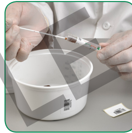
Transfer the swab into the FecalSwab™ tube and check that the maximum filling line ("MAX. FILL") on the label is not exceeded. NOTE: If sample collected exceeds maximum fill line discard the swab and the tube and collect a new specimen using a different FecalSwab™.