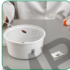
Remove and examine to make sure there is fecal material visible on the tip of the swab. If needed, insert again the flocked swab into stool sample and rotate making sure all the area of the swab tip is in contact with the sample.