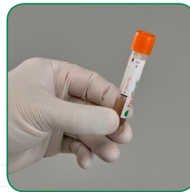
Shake the vial until the sample appears homogeneous.