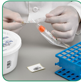
Open the peel pouch