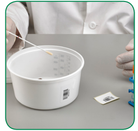
Collect a small amount of stool by inserting all the tip of the flocked swab into stool sample and rotate it. NOTE: Bloody, slimy or watery area of stools should be selected and sampled.