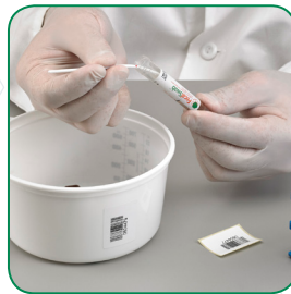
Hold the tube away from your face. Holding the end of the swab shaft, bend it at a 180 degrees angle to break at the marked break-point. If needed, gently twist the shaft between thumb and forefinger to completely remove it. Discard the broken upper part of the swab shaft and tighten the cap.