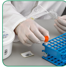
Remove the swab. Do not touch the swab tip. Always hold the shaft applicator above the marked break-point.