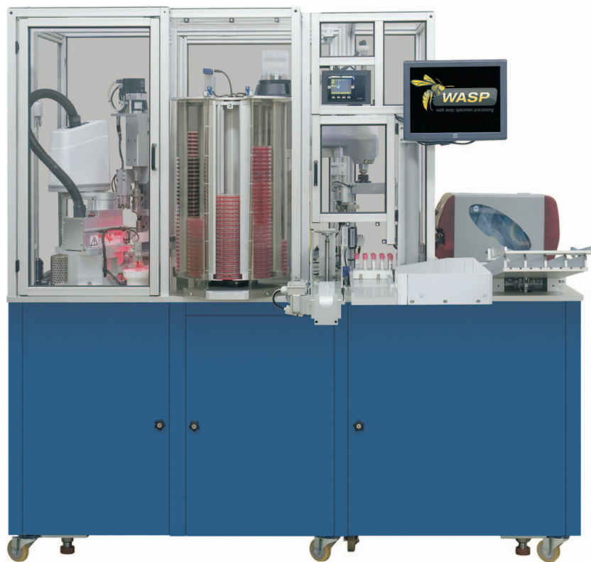
FIG. 1. Front view of the WASP. The dimensions of the instrument are 75 in. wide, 75 in. high, and 43 in. deep.

pension. The plates were incubated at 37°C and were examined at 24 h for growth.